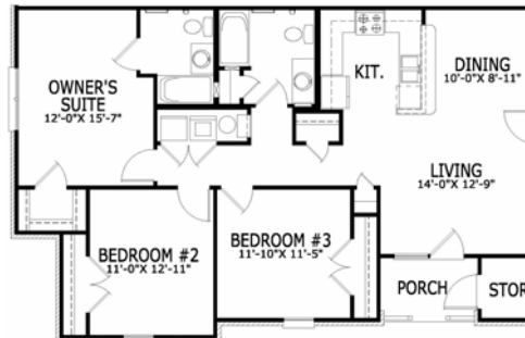
Three Bedroom/Two Bath