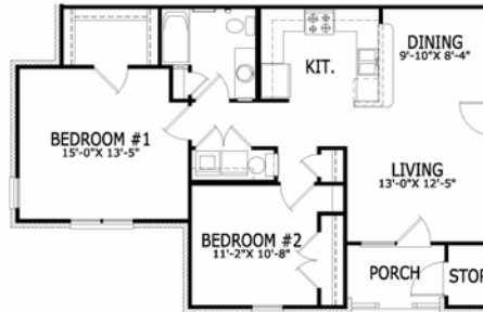
Two Bedroom/One Bath

For more information, please call 910-582-2071